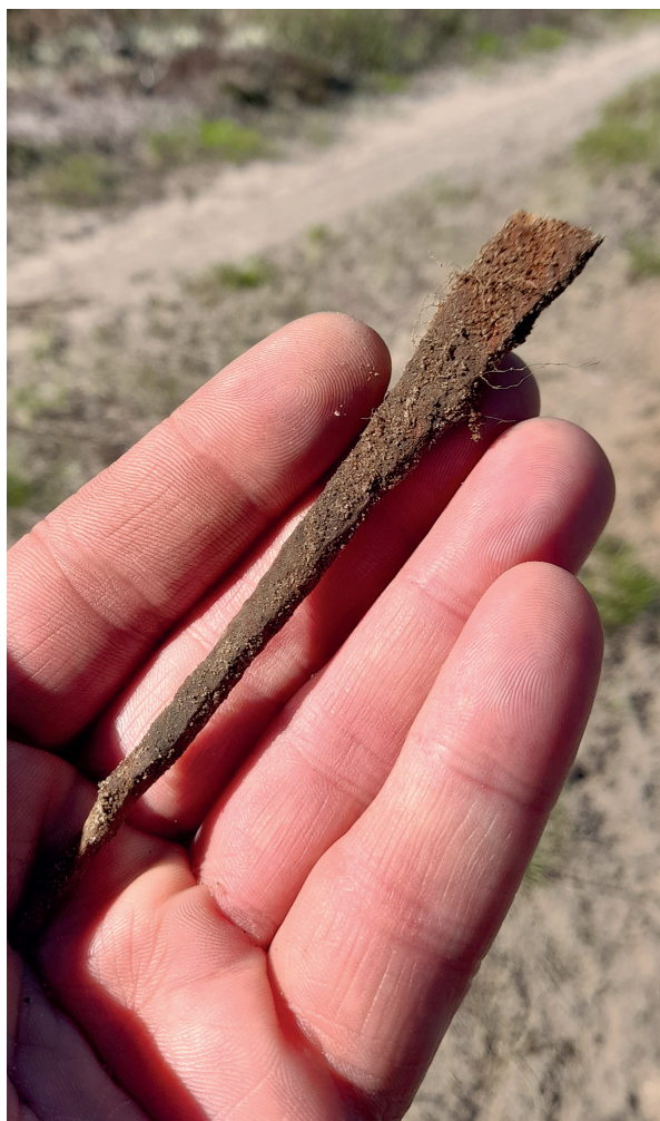
Figure 34.1. An even-headed arrowhead (KM43340:1) found by metal-detectorist and archaeology student Taneli Leinonen in spring 2021 in Vaala, northern Finland (Sirkkasuo 2). This is a good example of how metal-detecting provides new knowledge and research. When the find spot was later examined by an archaeologist, a fireplace was found close to the find spot. Together with the arrowhead and a piece of bronze sheet they may form the first Iron Age settlement site in this area.

ing from a single source, such as a hoard or a grave (Daubney 2016: 86–7). Critical is also not only findspot precision, but information on what level of recorded precision the coordinates are given at, so that the spatial data may be appropriately used. The ubiquity of GPS-enabled smartphones does provide a baseline for recording a reasonably high precision of findspot coordinates, and this can be encouraged by guidance from the authorities. An example of